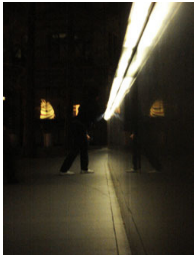
< Sneaking into enemy territory

Five minutes later and eight of us are hidden behind pillars working out what on earth to do next. I'm not sure any of us have played the game before. We don't know where the flag is, or much about the geography of the space. We creep forward along the main road trying to act nonchalantly.