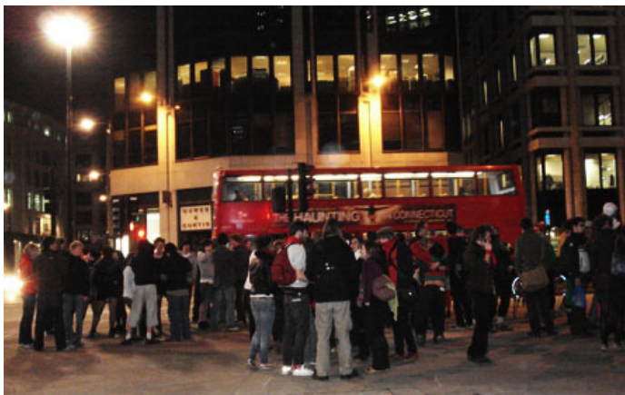
The teams gather at the start of the game

Standing outside Liverpool street station I was beginning to regret showing up. The game had been publicly announced a week before the G20 protests were to happen in exactly the same spot. Perhaps they thought it was a ruse rather than a game so the City police were out in force with a couple of evidence gatherers wandering around pointing cameras at anyone dressed in black.