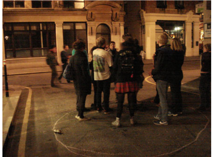
Trapped in jail!

Back in jail. But this time it's half time that saves me. Wandering back to no-man's land it's still a 0-0 draw.